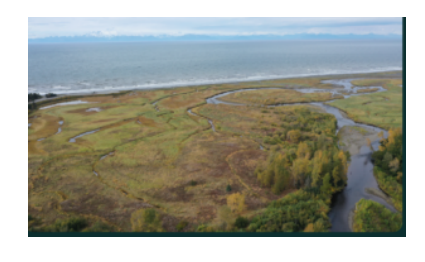
Connecting Across Tikahtnu: Kenai & Mat-Su Joint Fish Habitat Partnerships Symposium

dialogue topic idea! April 21-22, 2025 at the BP Energy Center, Anchorage. The intent of the symposium is to support healthy fisheries, people and economies on the Kenai Peninsula and in the Mat-Su by better connecting people and organizations working on salmon watershed stewardship in [...]