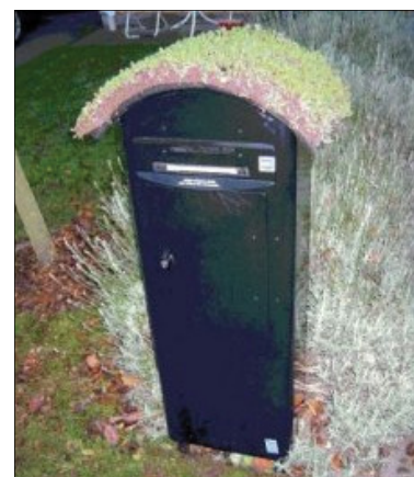
Green roofs aren't just for the roof to your house! Think about slowing runoff from other roofs, such as sheds, treehouses, even mailboxes!

The Mat-Su LID program can match half of the cost of your green roof with a maximum reimbursement of $500 . Contact planning@matsugov.us .