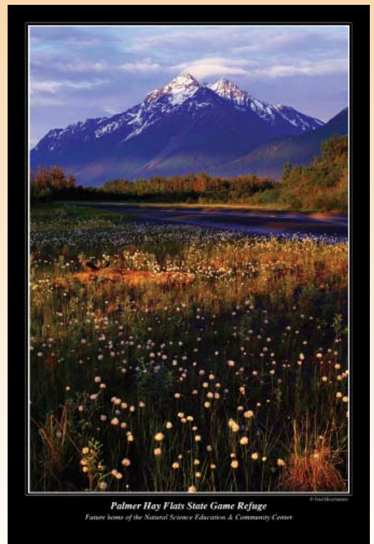
Palmer Hay Flats State Game Refuge Future home of the Natural Science Education & Community Center