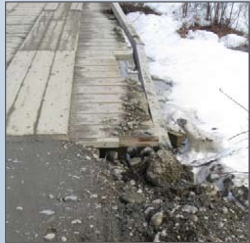
Typical erosion on substandard bridges